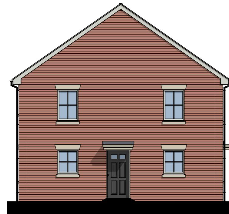
Side Elevation 2