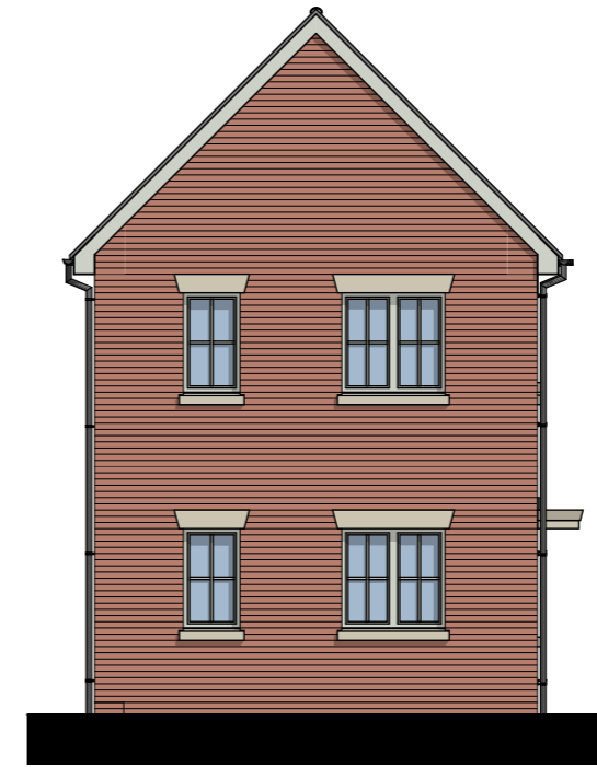
Side Elevation 1