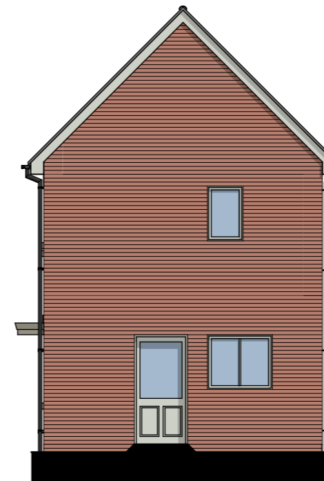
Side Elevation 1