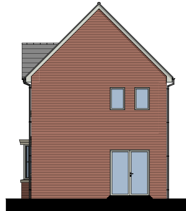
Side Elevation 2