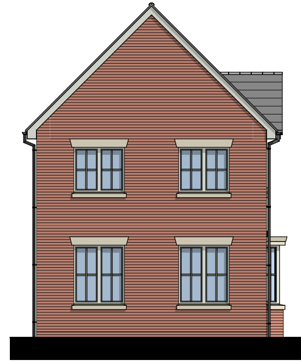
Side Elevation 1