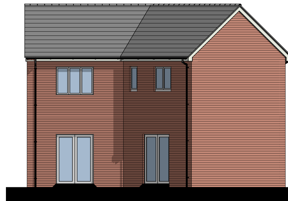
Side Elevation 2